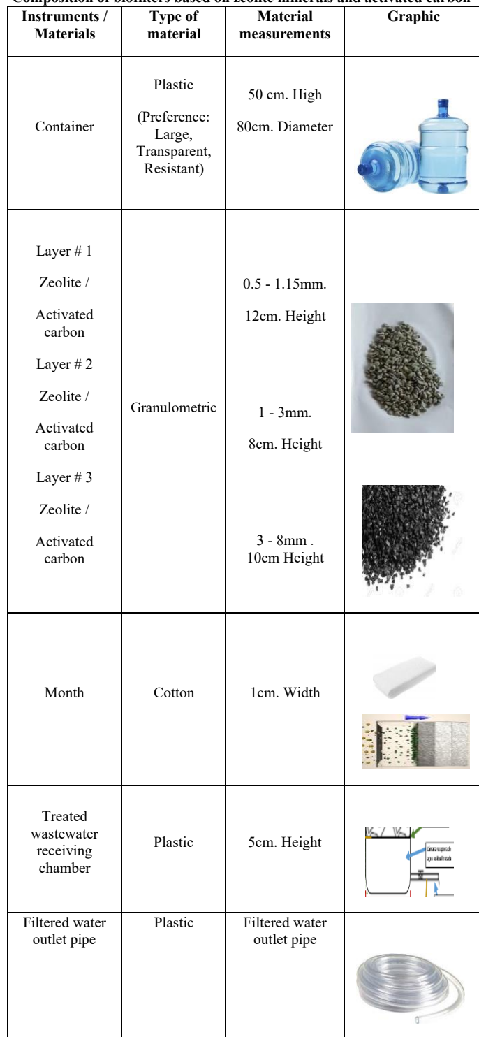
TABLE I Composition of biofilters based on zeolite minerals and activated carbon